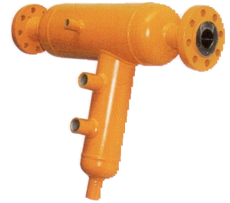
TYPE 120HB IN-LINE GAS-LIQUID/SOLID SEPARATOR WITH BOOT

Metal mesh or cartridges are available for a complete selection to separate two liquids for environmental conformance or product purity. Some models also remove solid particles.