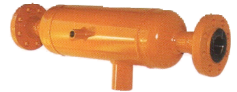
TYPE 120H IN-LINE STEAM & AIR SEPARATOR REMOVES CONDENSATE OIL AND PIPE SCALE