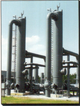
SERIES 120 GAS SCRUBBER