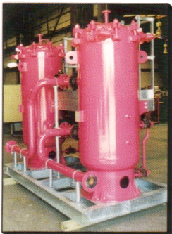
FILTERS AND CARTRIDGES