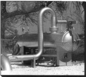
SERIES 150 FILTER-SEPARATOR