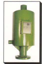
TYPE 209 GAS/AIR-LIQUID EXHAUST HEAD